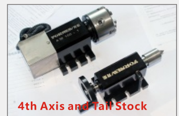
4th Axis and Tail Stock