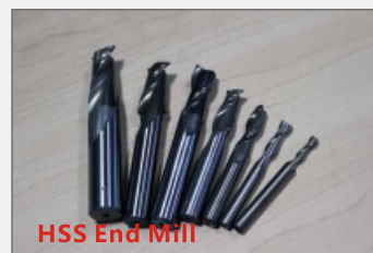
HSS End Mill