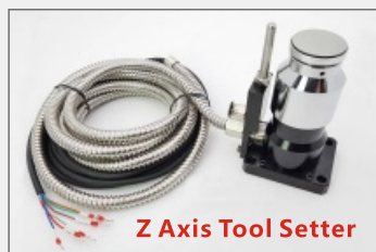
Z Axis Tool Setter