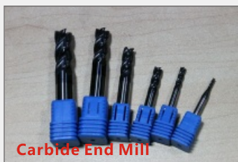
Carbide End Mill